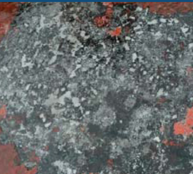
Surface - Rotating Nozzle