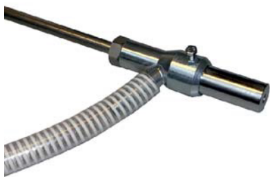
Sand a Equipment