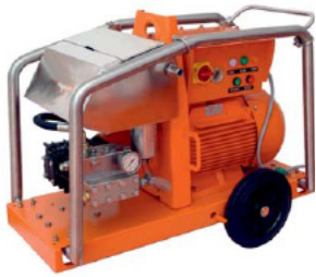
CE20-500 Super Slim