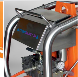
One centralized and balanced lifting eye.