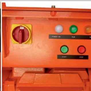
Die cast electrical box with main switch and overload relay.