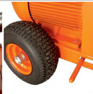
Galvanized frame with built in brake and pneumatic wheels.