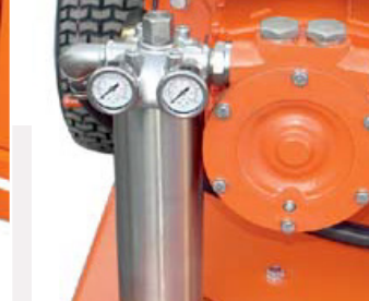
Stainless steel pump-head. Integrated cooling for plunger-seals.