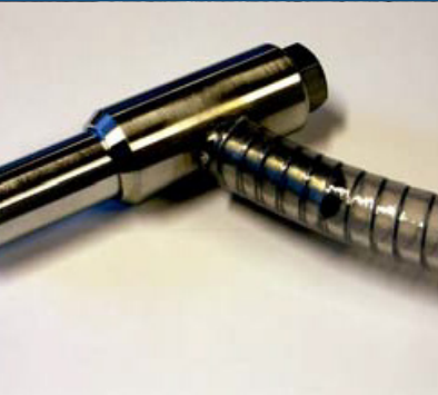
Sand Blasting Equipment