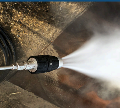
Ultra-Impact Nozzle 3000