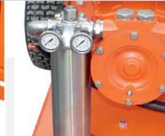
Stainless steel pump-head. Integrated cooling for plunger-seals.