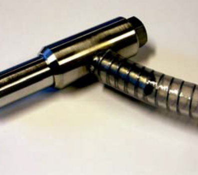
Sand Blasting Equipment