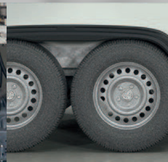
Large set of tyres