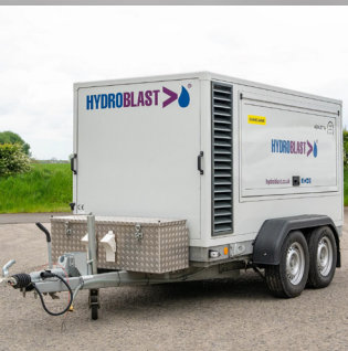
Fully galvanised chassis