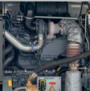
Tier 5 industrial engine