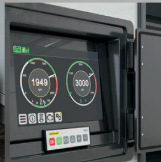
ES 4 control unit