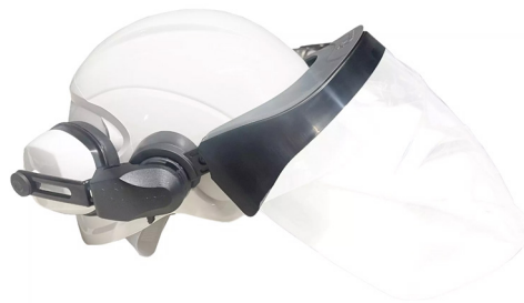
Helmet And Visor