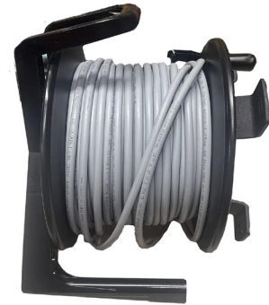
Control Cable 50m