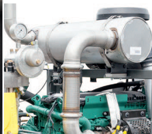
Sturdy industrial engine