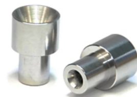
Hydroblast 952 Pencil Nozzle