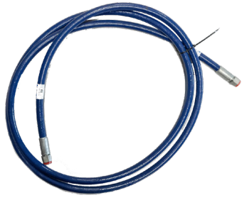
1600 Bar M24 Hose