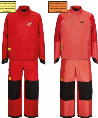
TST Suit 10/28 – 20/30