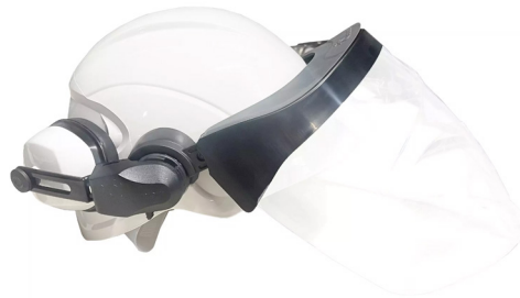
Helmet And Visor