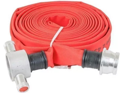
Layflat Type 2 Fire Hose