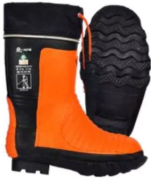
UHP Water Jetting Wellies