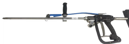
3000 BAR Dump Gun