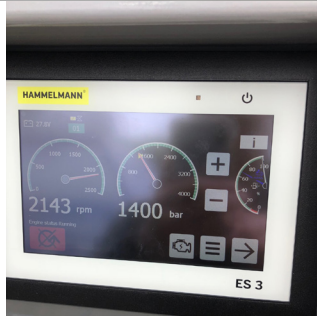
Energy savings through high efficiency