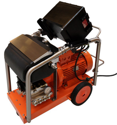
CEX 20 Series