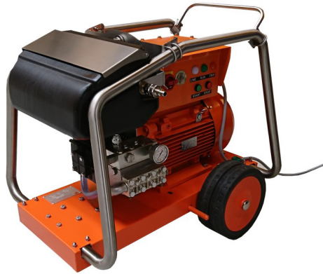
CE 20 Series