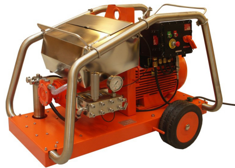
CEX 40 Series