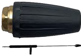
Single barrel lance with rotating nozzle