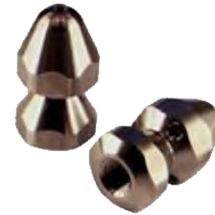
Drain cleaning nozzle