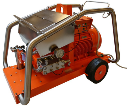
CE 40 Series