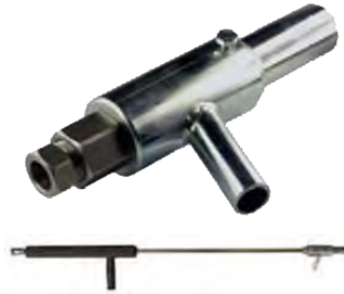
Single barrel lance with sand blasting kit c/w boron carbide nozzle