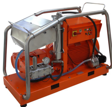
CE 100 Series