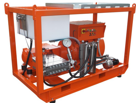
CE 150 Series