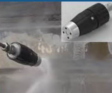
Ultra impact rotating nozzle