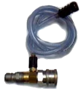
High pressure quick coupling