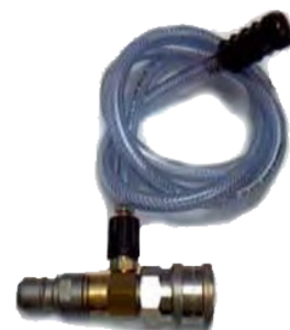
High pressure quick coupling