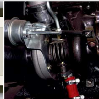
4 Cyl. Turbo Diesel Engine