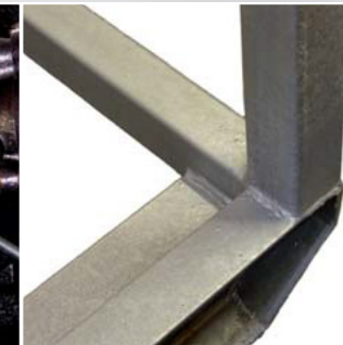
Hot Dip Galvanized Frame