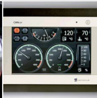
Electronic Engine Controller