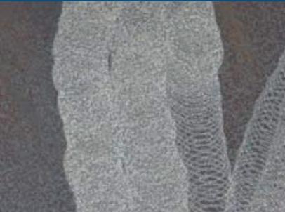
Water Blasting With Rotating Nozzles