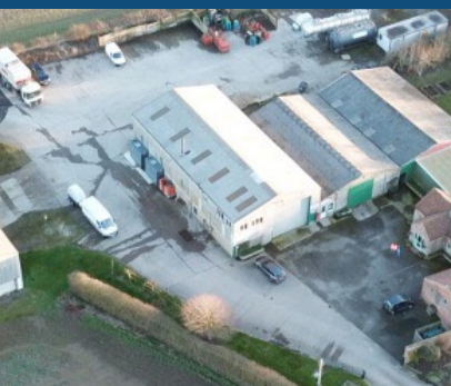
Hydroblast based in Yorkshire England